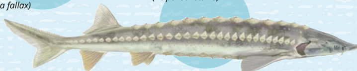
European sturgeon ( Acipenser sturio )