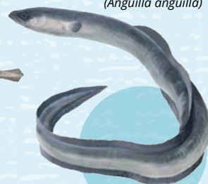
European eel ( Anguilla anguilla )